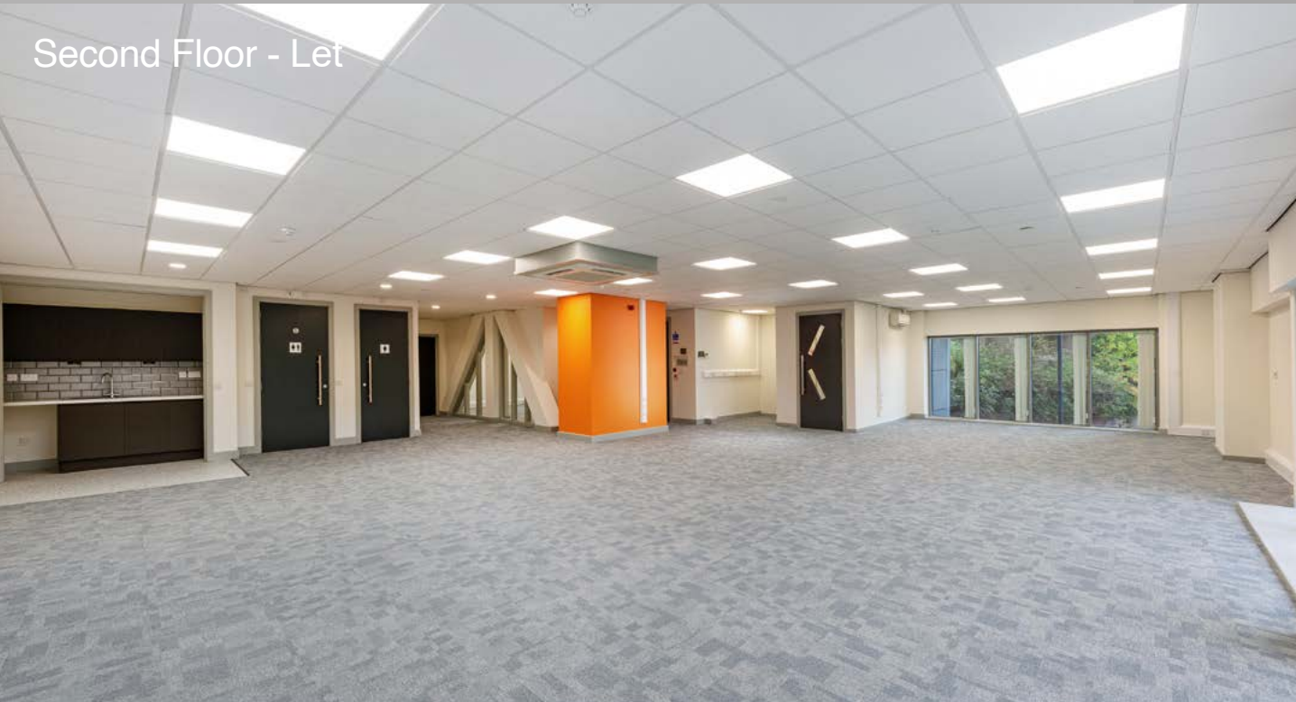
Second Floor - Let

Each party to be responsible for their own reasonable legal costs incurred in the transaction, plus all VAT thereon.