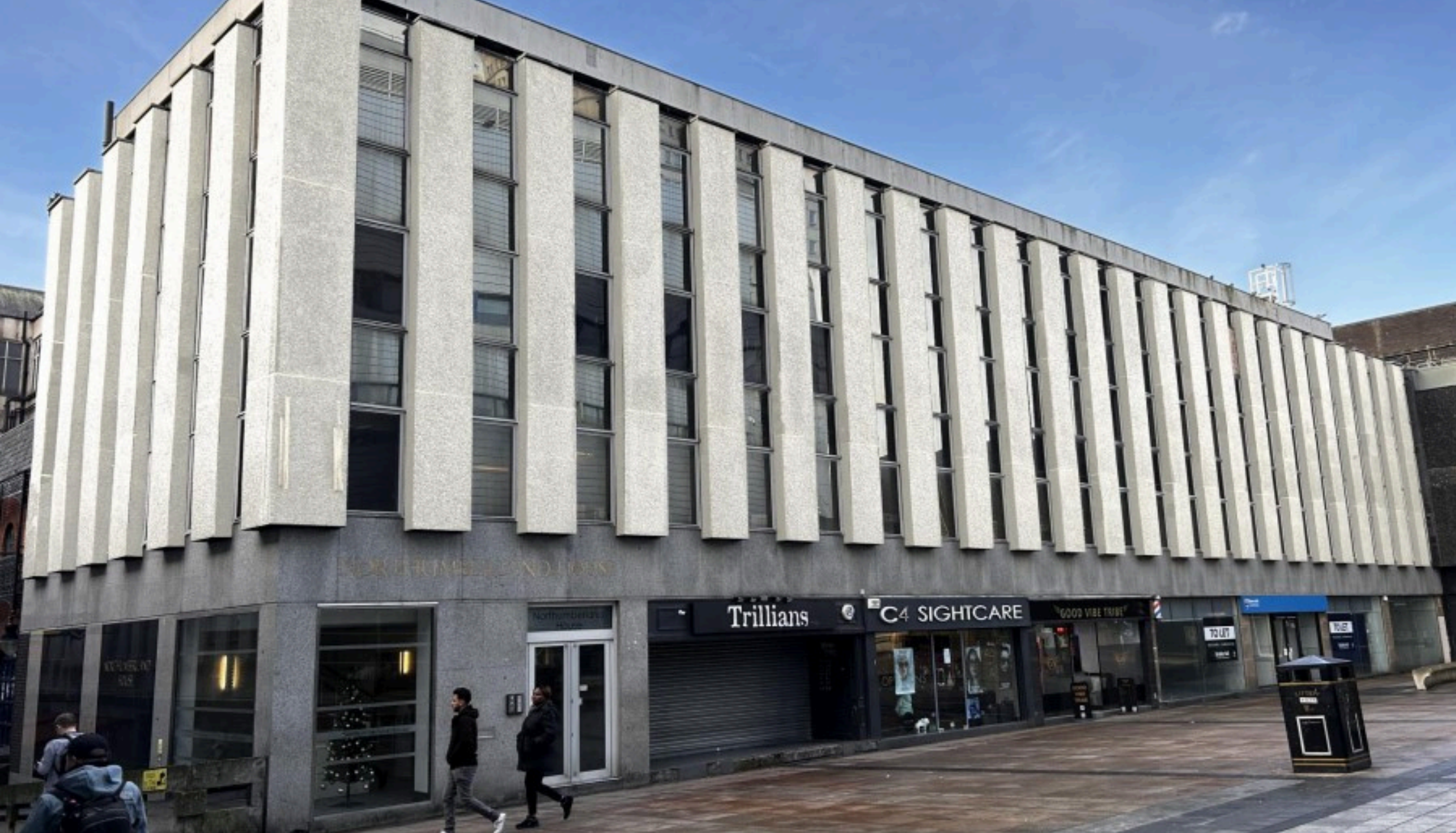
NORTHUMBERLAND HOUSE, PRINCESS SQUARE, NEWCASTLE UPON TYNE, NE1 8ER