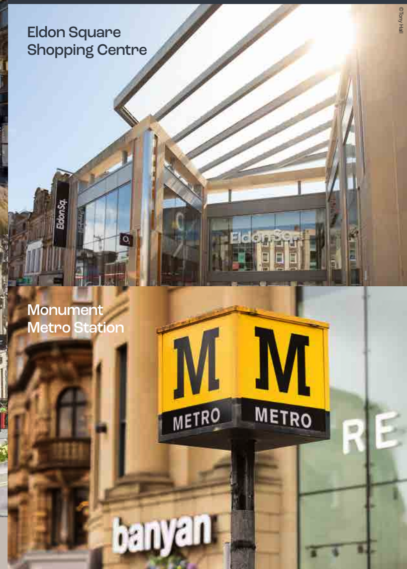
Monument Metro Station