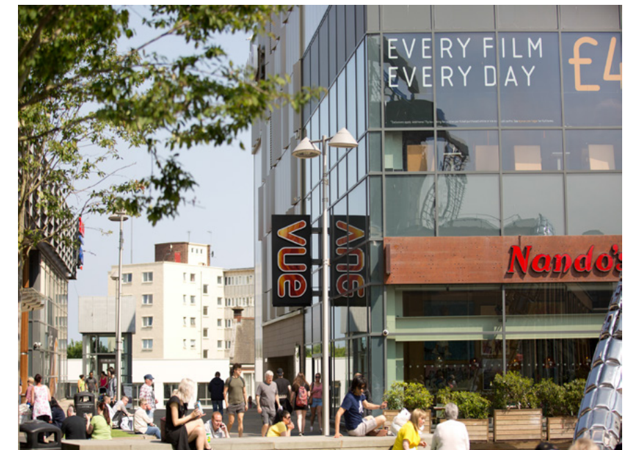
Gateshead Town Centre

Pedestrian access to Newcastle Quayside is enabled via the Millennium Bridge, broadening the amenity to occupiers at Baltic Place.