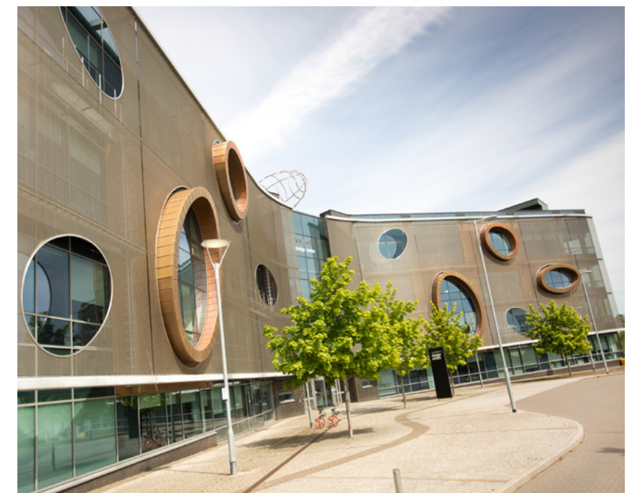
Northern Design Centre

Gateshead is fast becoming an important Tech-Hub with a regional and national importance, with 30% more technology employees than the national average, and forecast growth of 47% in the tech sector over the next 5 years, Baltic Place provides an excellent environment in which to locate your business.