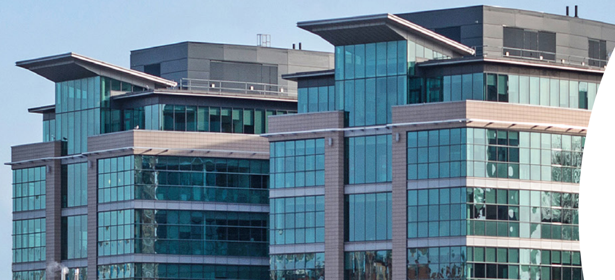
BALTIC PLACE EAST