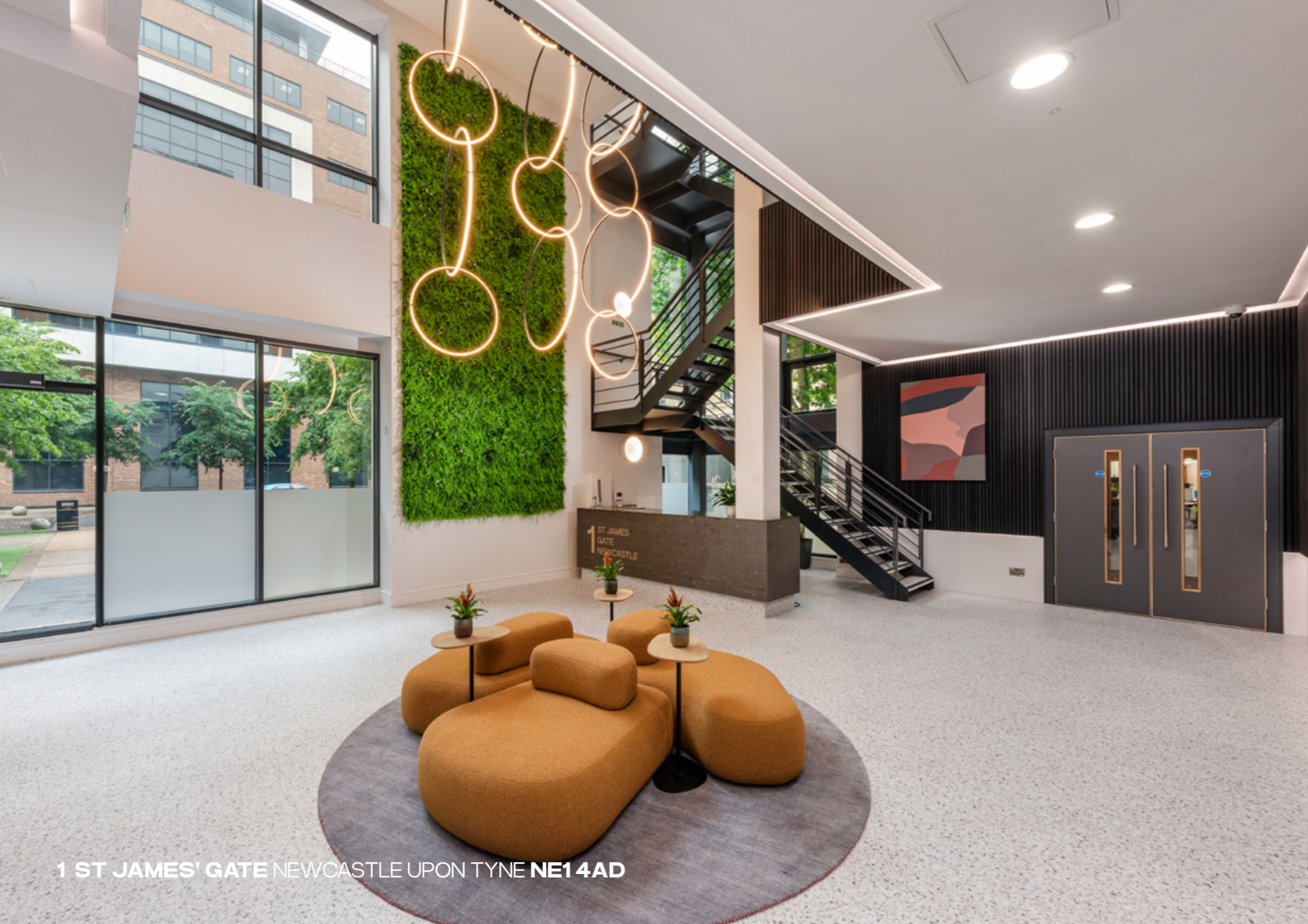
1 ST JAMES' GATE NEWCASTLE UPON TYNE NE1 4AD

BOASTING BEST-IN-CLASS AMENITIES IN AN ESTABLISHED CITY-CENTRE LOCATION, WITH REGULAR, RECTILINEAR FLOORPLATES AND OPTION FULLY-FITTED SPACE READY FOR TENANTS' OCCUPATION ON DAY ONE.